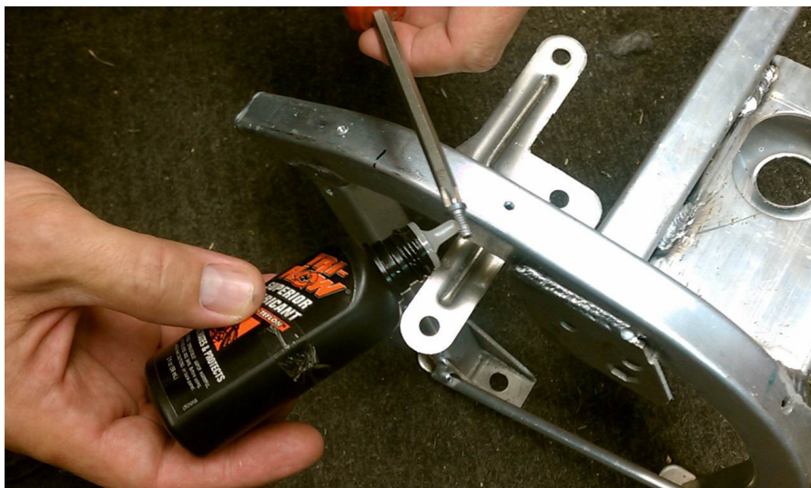
Fig.6 Put a drop of oil on the Self Tapping Screw that came in your kit. Oil is a MUST! This will help the self tapping screw cut clean threads.