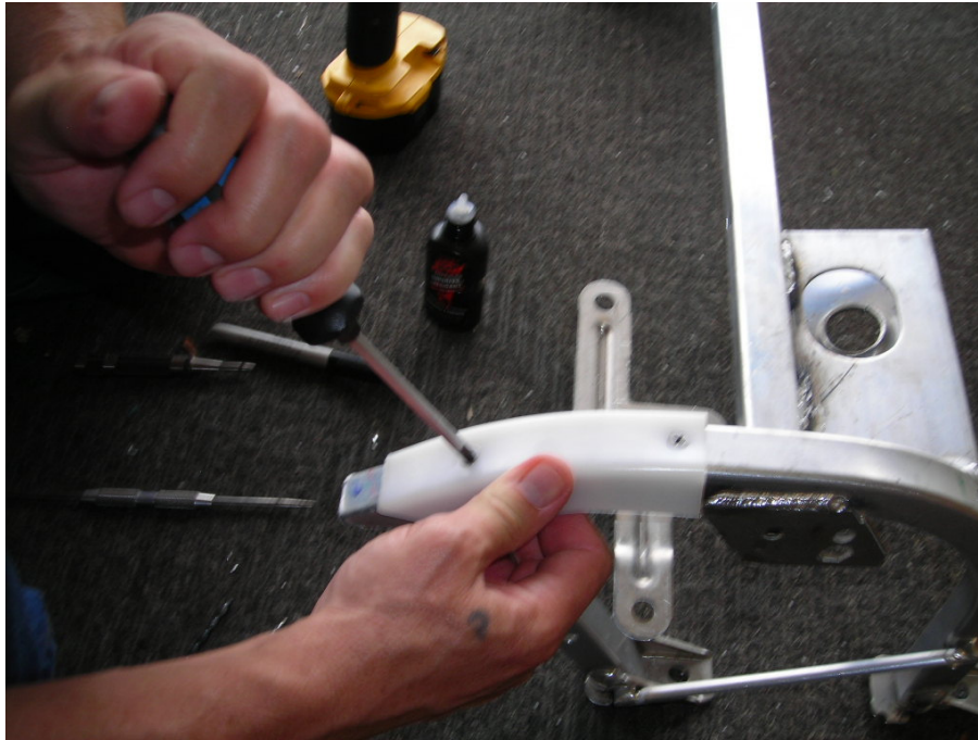
Fig.11 . NOTE: We recommend using Blue #242 Loctite on the threads of the Black Screws for this step just to make sure they don't come loose. Now install the Fang with the supplied Black screws and down snug it down. Don't over tighten, aluminum threads can strip easily!