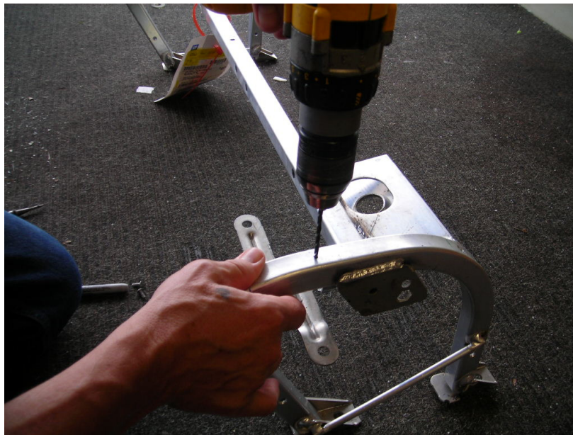
Fig.5 Drill hole with the supplied drill bit that came in your kit. It is very important to drill exactly where you made the punch mark and keep the drill Parallel to the skid plate for proper fit of the Fang.