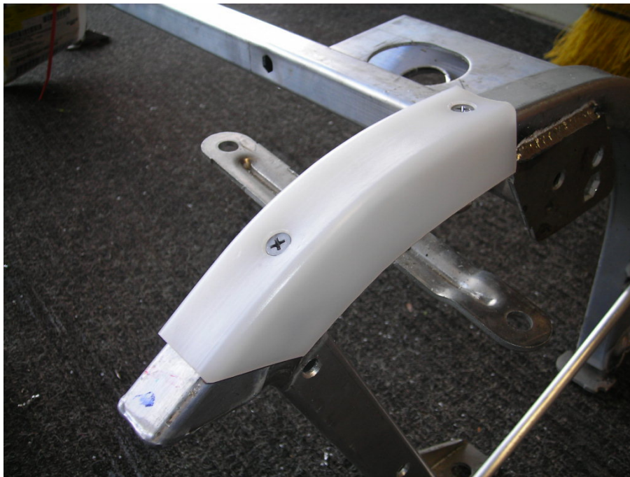
Fig.12 The Screws should be just below the surface of the Fang.

Now you have the best protection for your Skid Bars with your Patent Pending Fangs!