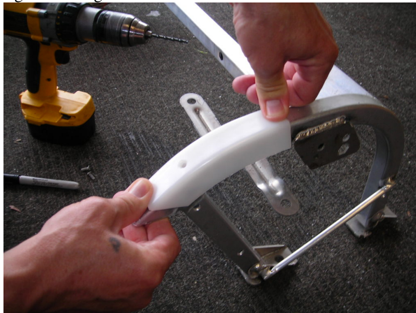
Fig.2 Adjust Fang to get the best fit on Skid Bar.