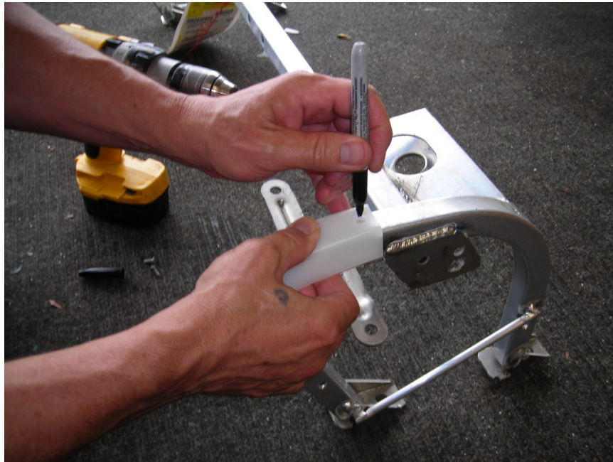
Fig.3 Carefully mark only one hole. It's important to be accurate when marking the hole.