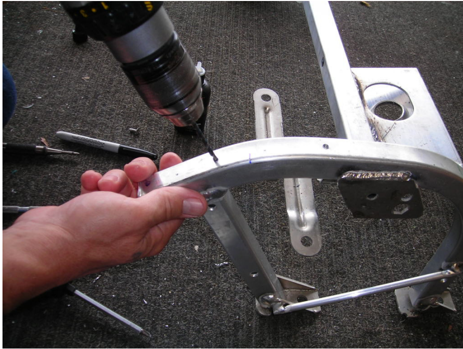
Fig.9 Remove Fang and drill second hole keeping drill parallel to Skid Plate.