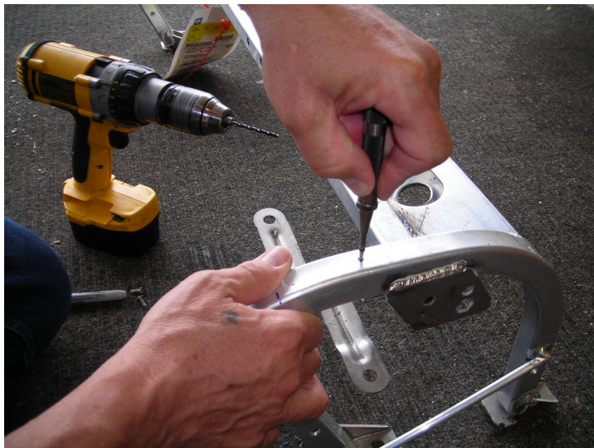
Fig.4 Use a center punch to mark the spot where the hole will be drilled. The center punch will help you drill the hole accurately and keep it from walking.