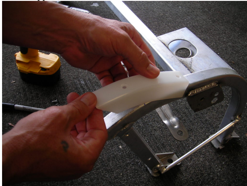
Fig.1 Fit Fang onto Skid Bar.

For the purpose of this installation we are going to be using a C6 Skid Plate/Lower Radiator support that is off of the C6 Corvette for better visibility.