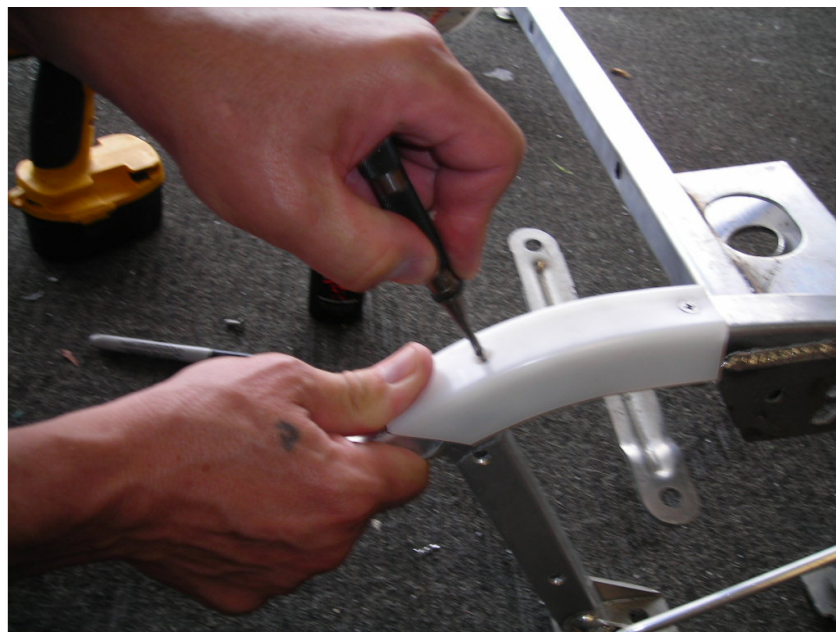
Fig.8 Hold Fang flush with skid bar and carefully mark and center punch where second hole will be drilled.