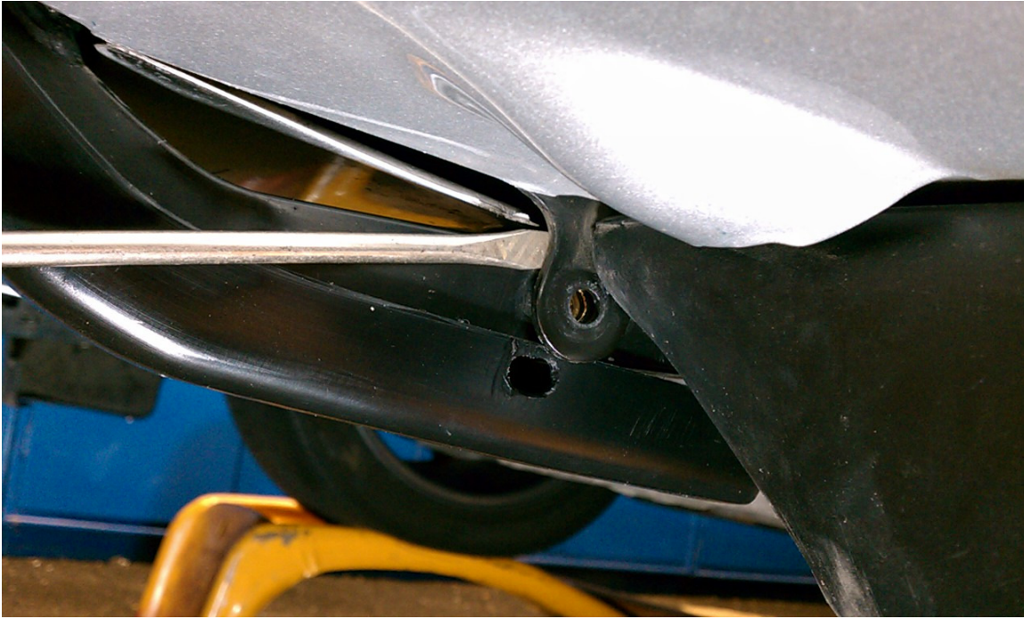
Fig 2 One of your Black Fangs has two holes in it. That one is the left or drivers side. On the left skid plate remove the air pump bracket bolt. Pry the bracket away from the skid plate just enough to slip the Fang between the bracket and the skid plate, about 1/8 inch. Fit the front of the Fang onto the skid plate first then slip the rear between the air pump bracket. Slip the Fang back and forth to get the best fit on the skid plate.