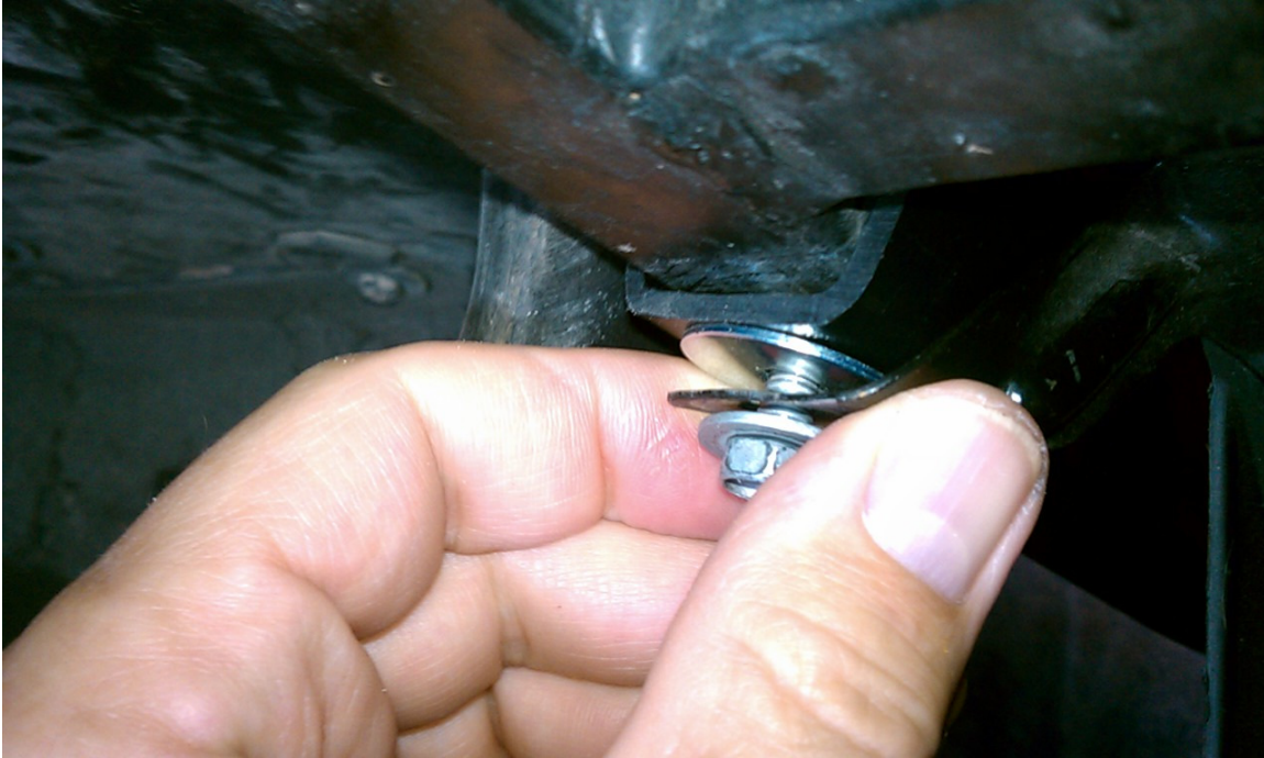
Fig 4 Install the air dam by temporarily installing the bolt on the right side to help hold it up while on the left side install the supplied washer between the Fang and the air dam bracket. Just hand tighten for now. Install the right side Fang in the same manner. Remember to slide it back and forth to get the best fit on the skid bar. No retainer is necessary on the front of the Fangs.