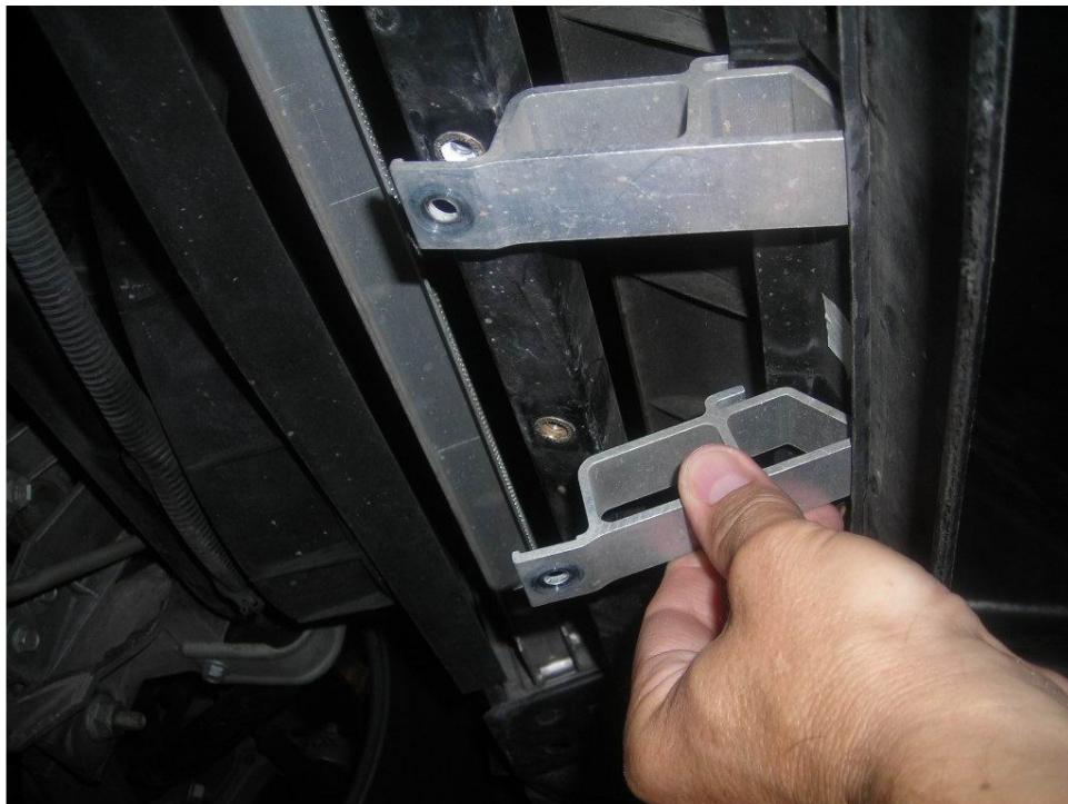
Fig 5 Reinstall the air dam center brackets.