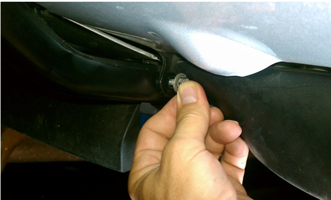
Fig 3 Reinstall the air pump bolt but don't tighten it.

Fig 2 One of your Black Fangs has two holes in it. That one is the left or drivers side. On the left skid plate remove the air pump bracket bolt. Pry the bracket away from the skid plate just enough to slip the Fang between the bracket and the skid plate, about 1/8 inch. Fit the front of the Fang onto the skid plate first then slip the rear between the air pump bracket. Slip the Fang back and forth to get the best fit on the skid plate.